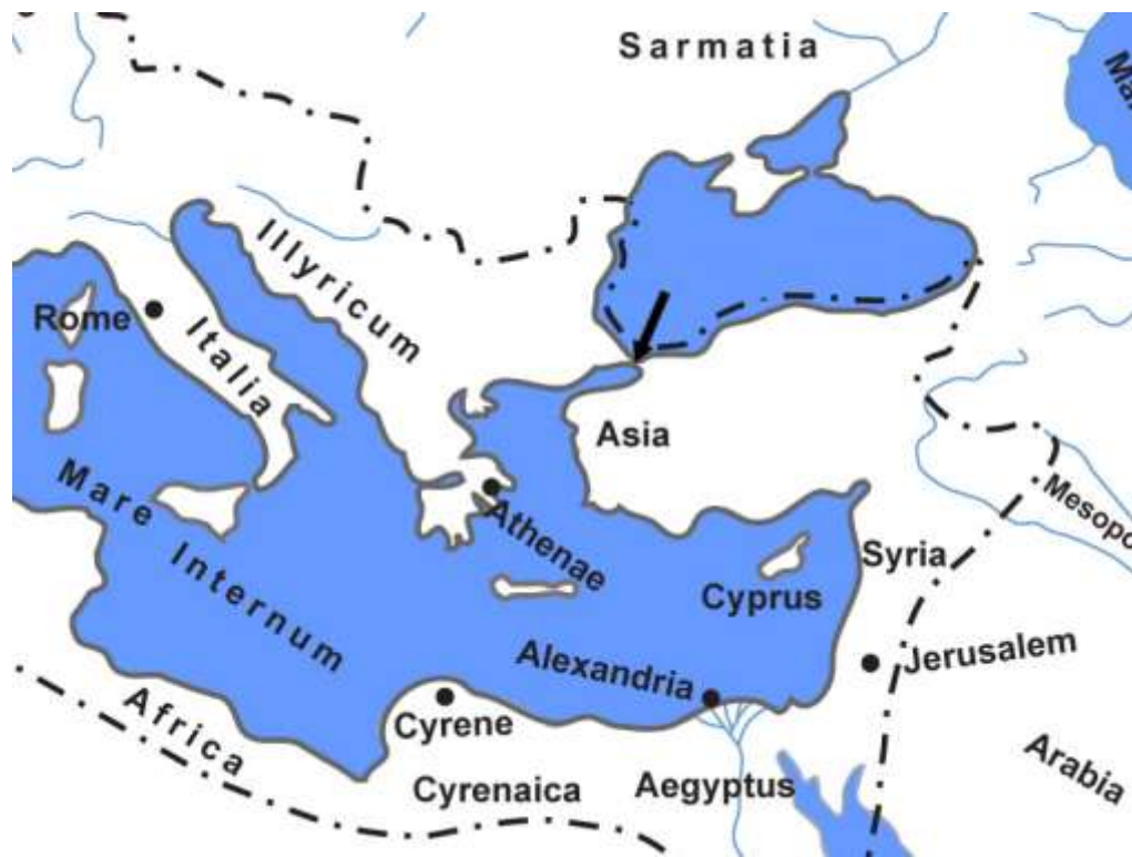
Map showing the linking geographical area connecting Europe, Africa and Asia.